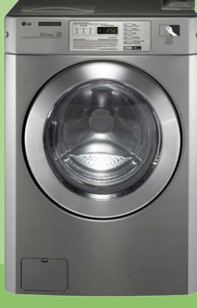
GCWP1069QS2 Coin-Operated Washer

LG Platinum Washers will interface with most leading payment systems.