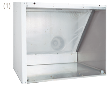
(1) Self-Cleaning Lint Screen