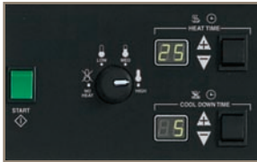
Dual Digital Control